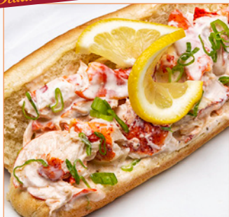
Lobster Roll Seasoned Lobster Meat on a Roll